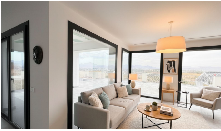
This is a visualization, furniture has been added