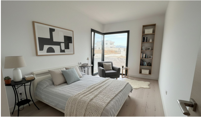
This is a visualization, furniture has been added