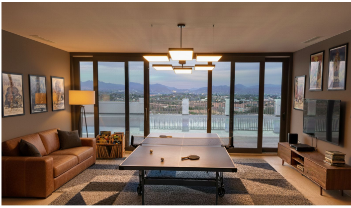
This is a visualization, furniture has been added