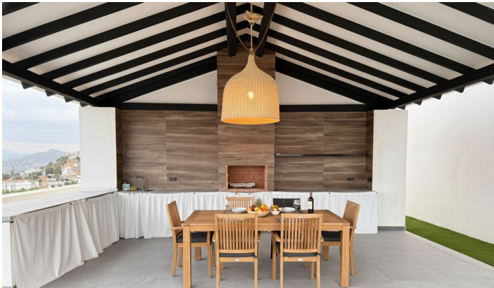
This is a visualization