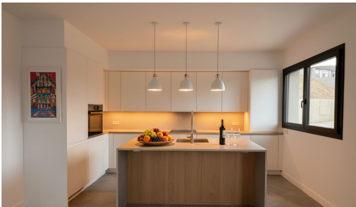
This is a visualization