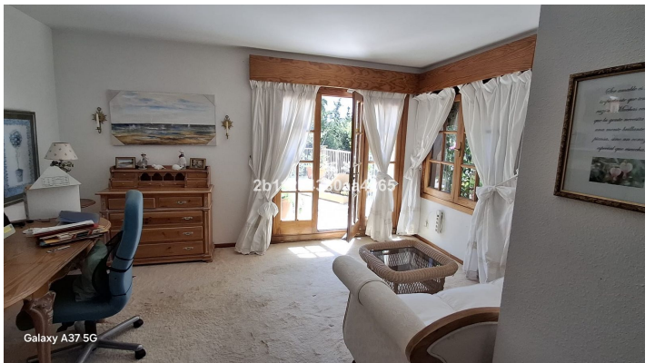
Galaxy A37 5G