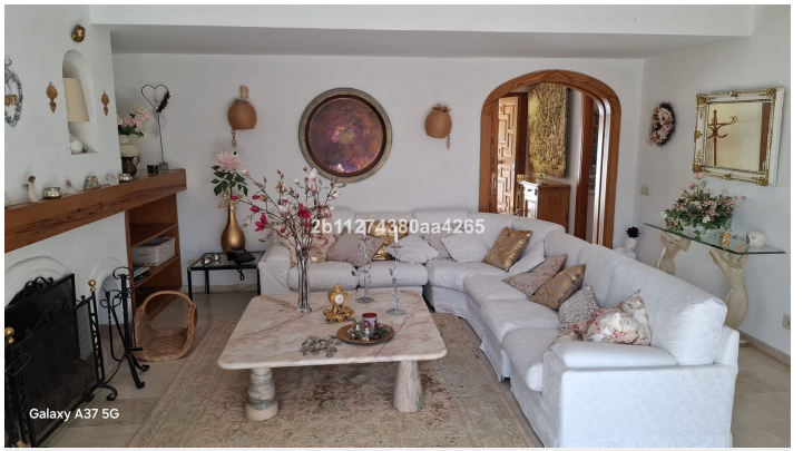
Galaxy A37 5G