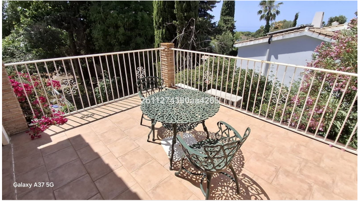
Galaxy A37 5G