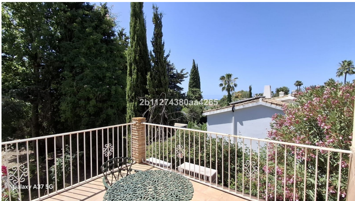
Galaxy A37 5G