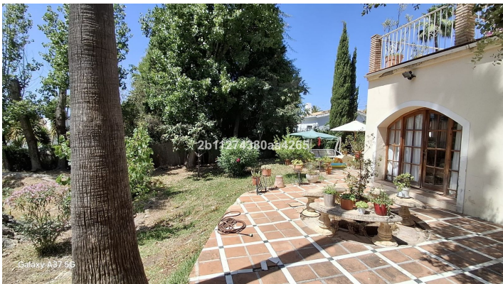
Galaxy A37 5G