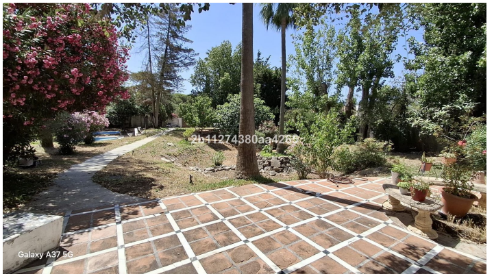
Galaxy A37 5G