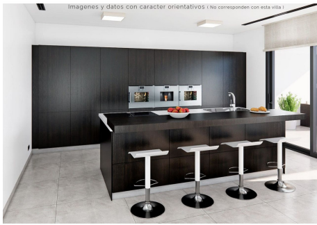
Imágenes y datos con caracter orientativos (No corresponden con esta villa)