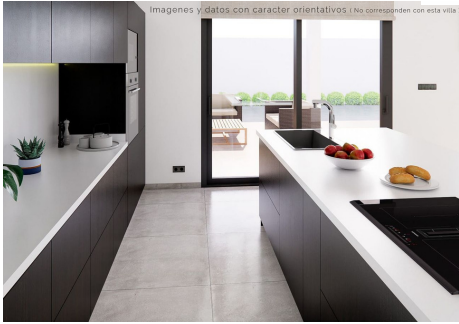
Imágenes y datos con caracter orientativos (No corresponden con esta villa)