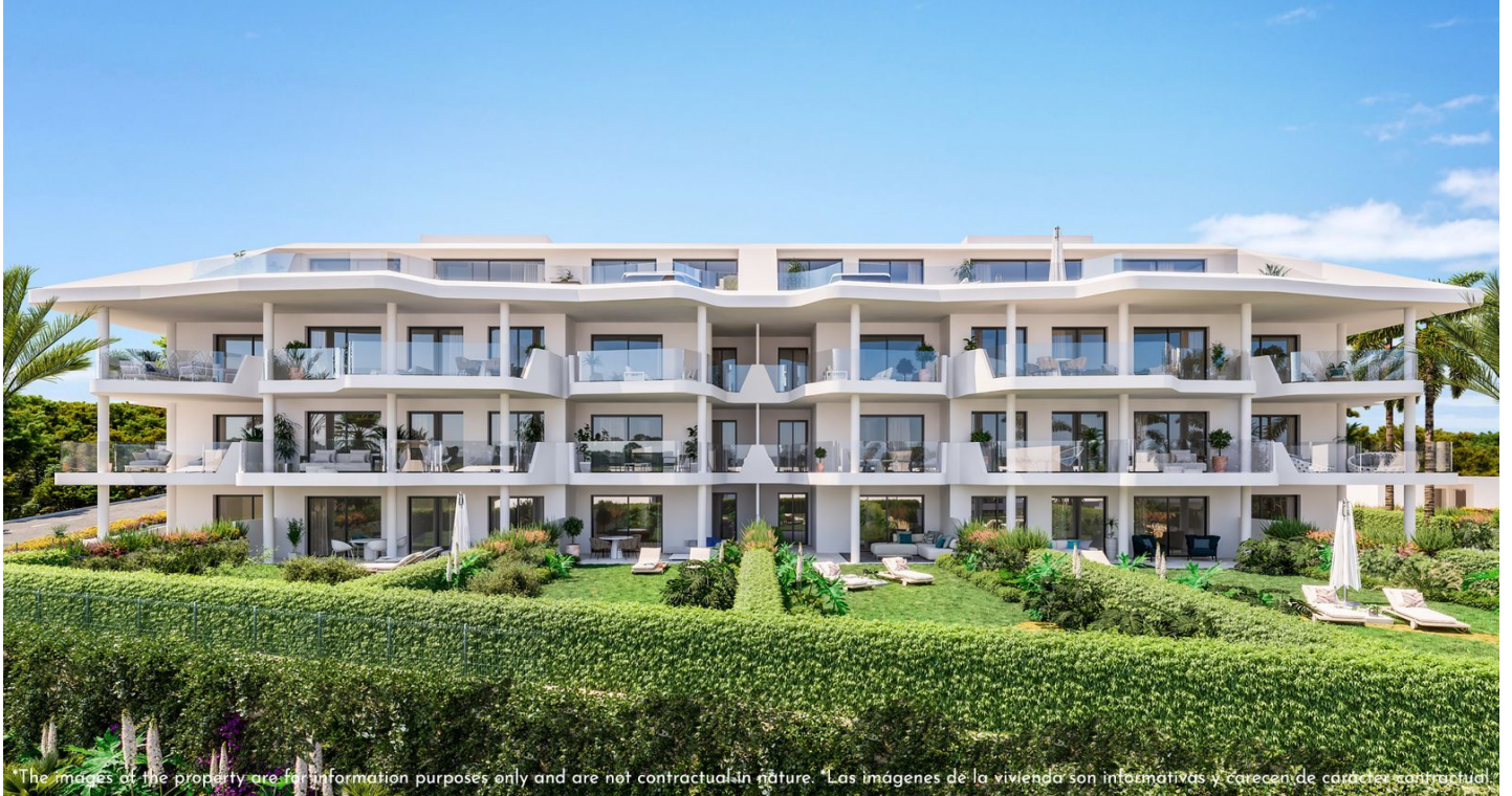
The images of the property are for information purposes only and are not contractual in nature. Las imágenes de la vivienda son informativas y carecen de carácter contractual.