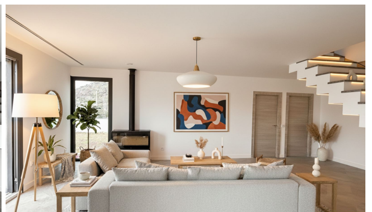
This is a visualization, furniture has been added