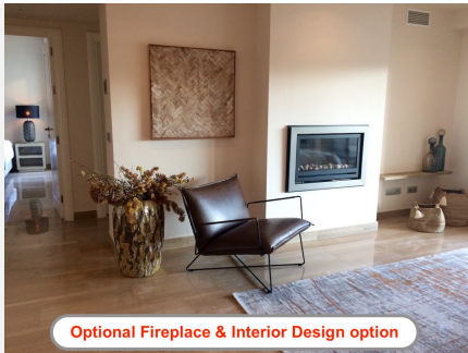
Optional Fireplace & Interior Design option

The built quality is superior to other apartments, whilst still offering a very competitive price per m2 is.