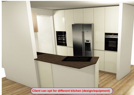
Client can opt for different kitchen (design/equipment)