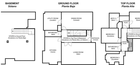
This is a representation of the layout of the property and it is not to scale. Esta es una representación de la distribución de la propiedad y no está a escala.