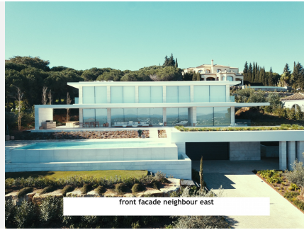
front facade neighbour east