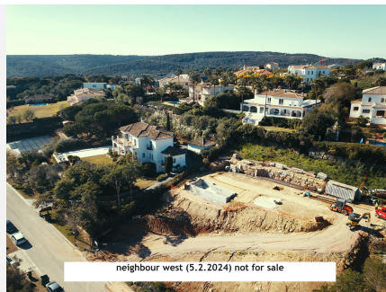
neighbour west (5.2.2024) not for sale