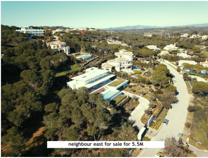
neighbour east for sale for 5.5M