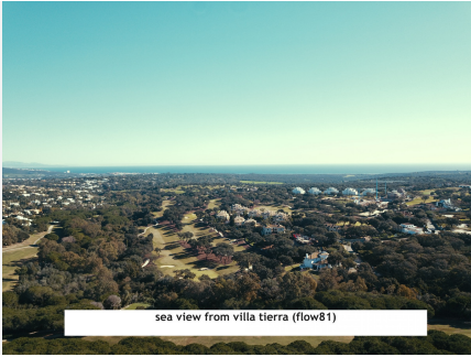
sea view from villa tierra (flow81)

WWW.VIVI-REALESTATE.COM WWW.VIVI-HOMES.COM