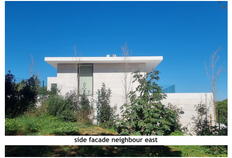
side facade neighbour east