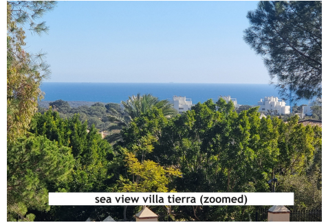
sea view villa tierra (zoomed)