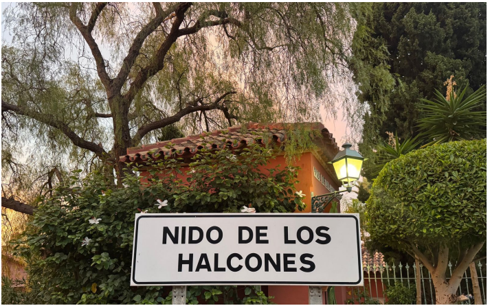
NIDO DE LOS HALCONES