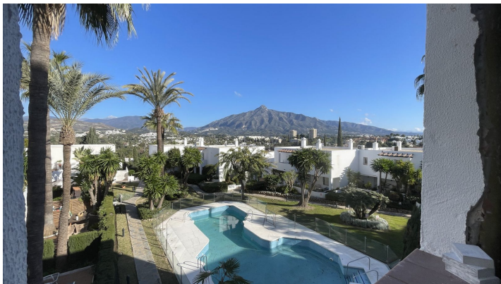
Apto. 10 ESTADO REFORMADO