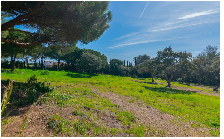
Los altos de Valderrama - Sotogrande