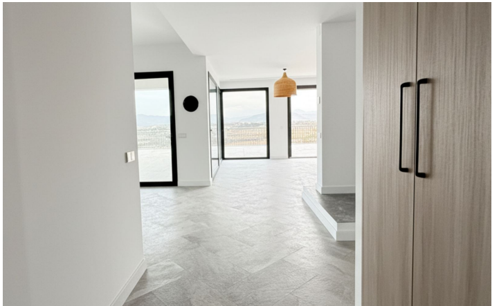
This is a visualization