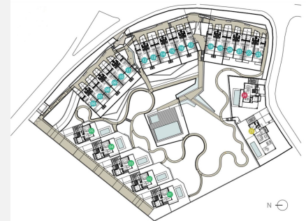
3 Bedroom Townhouse at La Vera de Marbella, Elviria