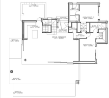
PLANTA BAJA Tipo A